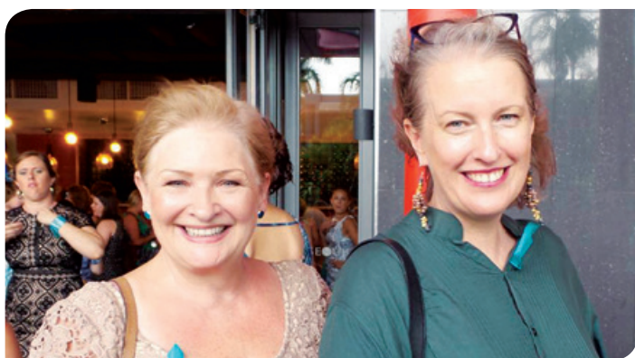
Ovarian Cancer Australia fundraisers.

Limited ACN 097 394 593 Queen Victoria Women's Centre Level 1, 210 Lonsdale Street Melbourne, VIC 3000