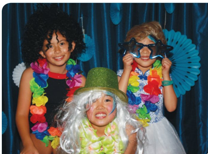
Dancers at the Dance-O-thon for Ovarian Cancer.