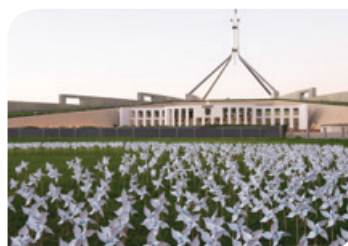
1,480 windmills on Teal Ribbon Day, representing the women who will be diagnosed.