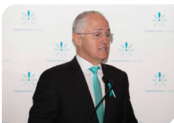
Prime Minister, the Hon Malcolm Turnbull.

6 PARLIAMENTARY OVARIAN CANCER AWARENESS EVENTS