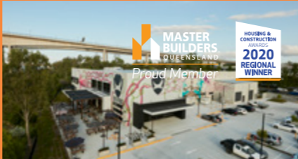
BREWDOG (MURARRIE) Queensland Master Builders Regional Winner, Brisbane | Retail Facilities up to $5 million