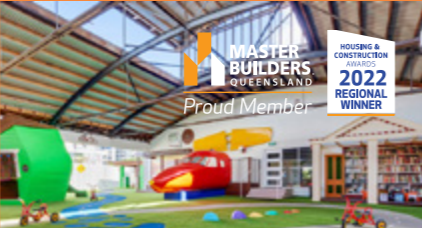
KIDS CLUB HAMILTON (HAMILTON) Queensland Master Builders Regional Winner, Brisbane | Commercial Building up to $5 million