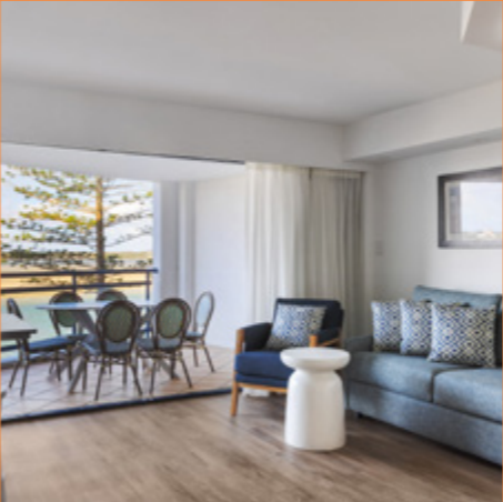
HOTELS & TOURISM