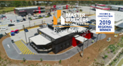
EAGLEBY SERVICE CENTRE (EAGLEBY) Queensland Master Builders Regional Winner, Brisbane | Commercial Building up to $5 million