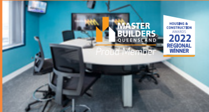
SOUTHERN CROSS AUSTEREO STUDIOS (URRAWEEEN / FRASER COAST) Queensland Master Builders Regional Winner, Wide Bay Burnett | Commercial Building up to $5 million