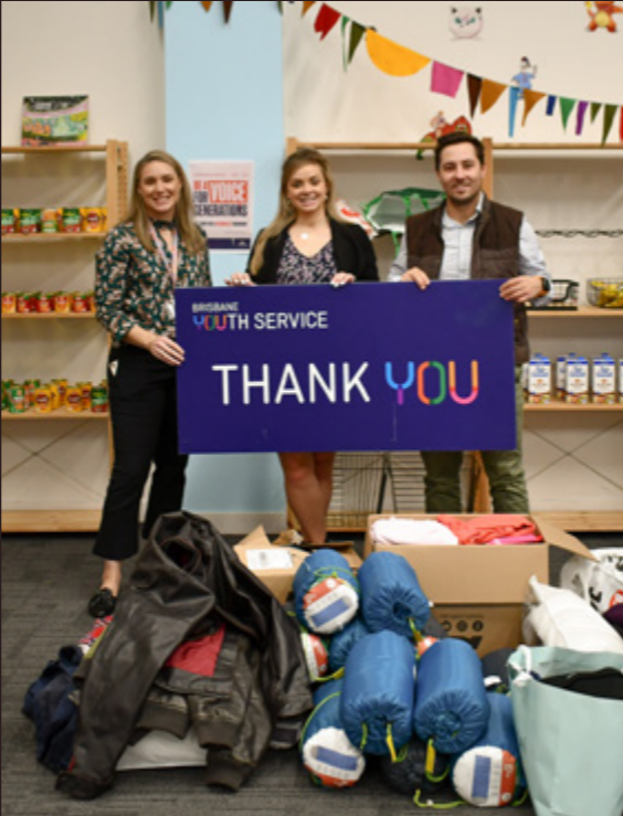
WINTER WARMERS SUPPORTING BRISBANE YOUTH SERVICE

By investing our resources, time and expertise in community-driven projects, we aim to create positive change that extends beyond our business operations. We engage in an ongoing dialogue with the organisations we support, actively listening to their concerns and aspirations, to ensure we are better equipped to maximise the positive outcomes of our efforts. We foster strong connections within communities, supporting meaningful bonds that bring individuals together. We aim to build a network of relationships that enhance social cohesion, promote collaboration and create a strong foundation for community growth and development. Through our community support initiatives, we strive to make a positive and lasting impact on the lives of individuals, uplift communities and contribute to a more sustainable and inclusive world.