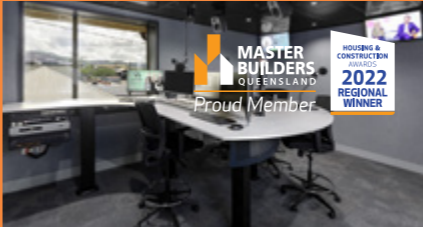
SOUTHERN CROSS AUSTEREO STUDIOS (ROCKHAMPTON) Queensland Master Builders Regional Winner, Central Queensland | Refurbishment/ Renovation over $750,000