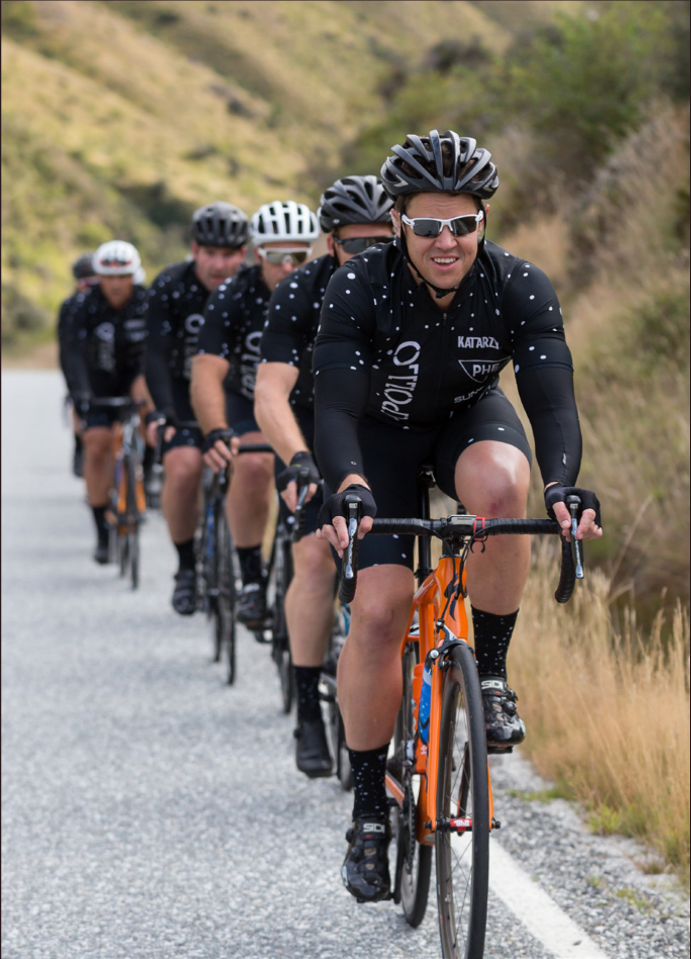
CHAIN REACTION CHALLENGE SUPPORTING AEIOU FOUNDATION AND RONALD MCDONALD HOUSE