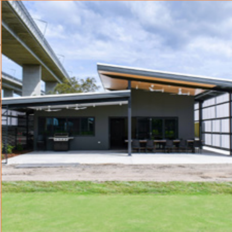
SPORTS & LEISURE