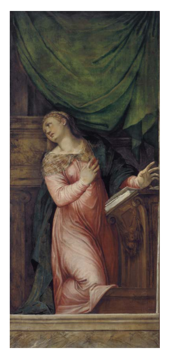
45Gianbattista Zelotti, Angel of the Annunciation, Virgin of the Annunciation,<br/>1551 ca., each 210 x 91 cm, Museo Civico, Padua<br/>(photograph by Giuliano Ghiraldini, courtesy of Musei Civici Padova)

Listed by the Uffizi as a work of Veronese, this Annunciation (figure 1) has also been attributed to Gianbattista Zelotti<sup>12</sup>. Examination of the Uffizi painting reveals that the facial features of Gabriel and Mary have the softness of Zelotti, but the folds and highlighting of the clothing are characteristic of Veronese. The dynamic grouping of the cloud of putti with the dove suggest Veronese, although the dove itself resembles the one in the Angel of the Annunciation and Virgin of the Annunciation , (figures. 4, 5). made for the organ doors of the Church of the Misericordia, Padua.