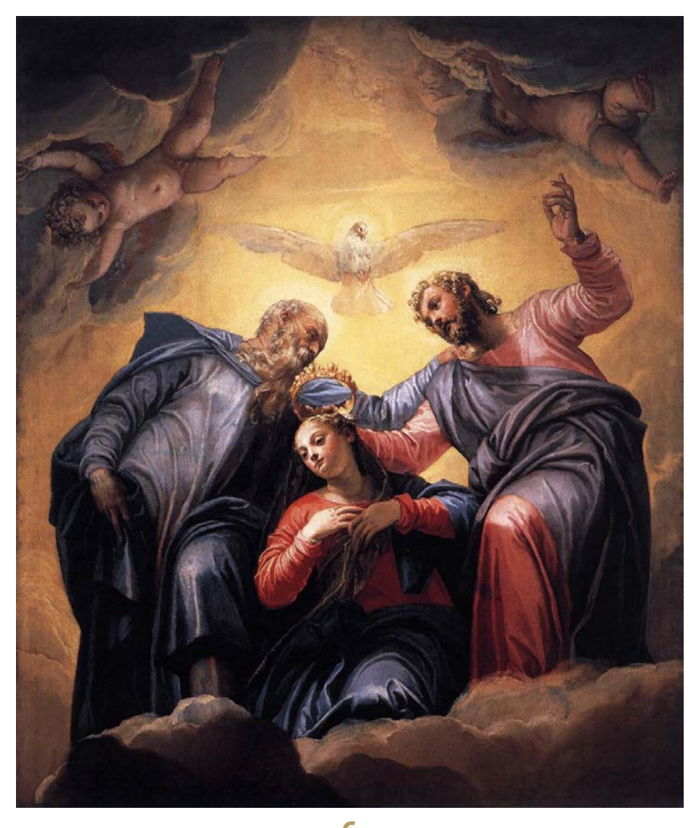
6 Paolo Veronese, Coronation of the Virgin, 1555, oil on canvas, 200 x 170 cm, Chiesa di San Sebastiano, Venice

of view, while comparison with Veronese's Coronation of the Virgin (figure 6) and related works in San Sebastiano completed around the same time led to the consensus that Veronese was the author of the Uffizi's Annunciation to the Virgin , which became the prototype for later Annunciation paintings by Veronese and his workshop<sup>14</sup>. Though its patron and intended site are unknown, the Uffizi's Annunciation to the Virgin (figure 1) seems to have been impressive to the patrons of Venice; the Scuola dei Mercanti Annunciation and the multiple paintings derived from that prototype possess the same quality of serene monumentality. The many Annunciations made by Veronese and his shop suggest that patrons sought him out for this theme. By the last decades of the sixteenth century, he had become a specialist painter of Annunciation scenes in Venice.