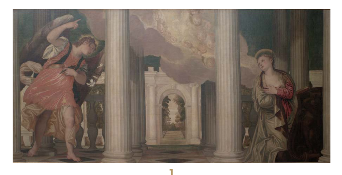
Paolo Veronese, Annunciation to the Virgin, 1551-56 ca., oil on canvas, 172 x 291 cm, Gallerie degli Uffizi

able to shield the inhabitants of the lagoon from harm, rather than a young girl who cowers in fear. Placing the event in a version of a contemporary Venetian setting emphasizes Mary's connection to the city. She is a woman of nobility, a representative of the citizens of Venice, themselves pious, obedient, graceful, and, through the vision of Saint Mark, singled out by divine favor.