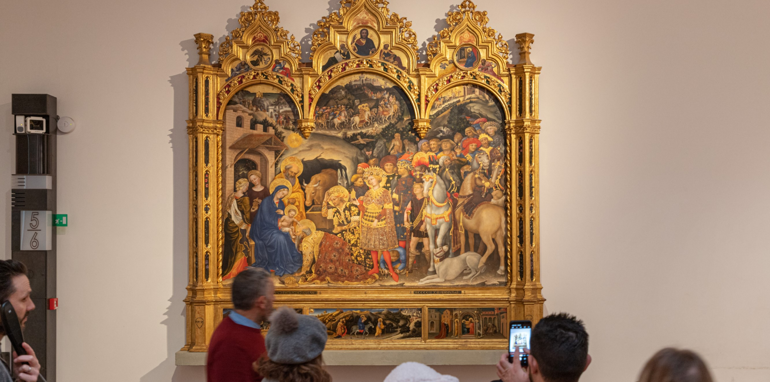
THE FIRST ARTWORK IS IN ROOM A7 LORENZO MONACO - GENTILE DA FABRIANO IT IS CALLED ADORATION OF THE MAGI BY GENTILE DA FABRIANO