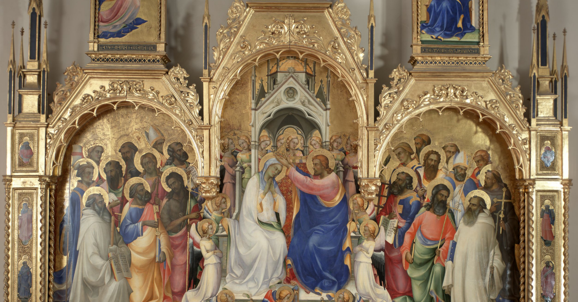
I FIND THE SECOND ARTWORK IN THE ROOM A7 LORENZO MONACO GENTILE DA FABRIANO IT IS CALLED CORONATION OF THE VIRGIN BY LORENZO MONACO