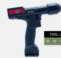
TOOL LIFE IS EXTENDED