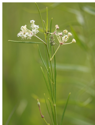
11 Asclepias verticillata APOCYNACEAE Whorled Milkweed