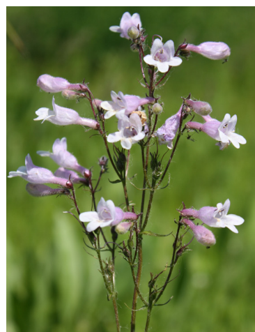
11 Penstemon digitalis PLANTAGINACEAE IR