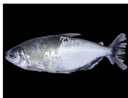
11 Brycon melanopterus (M) BRYCONIDAE