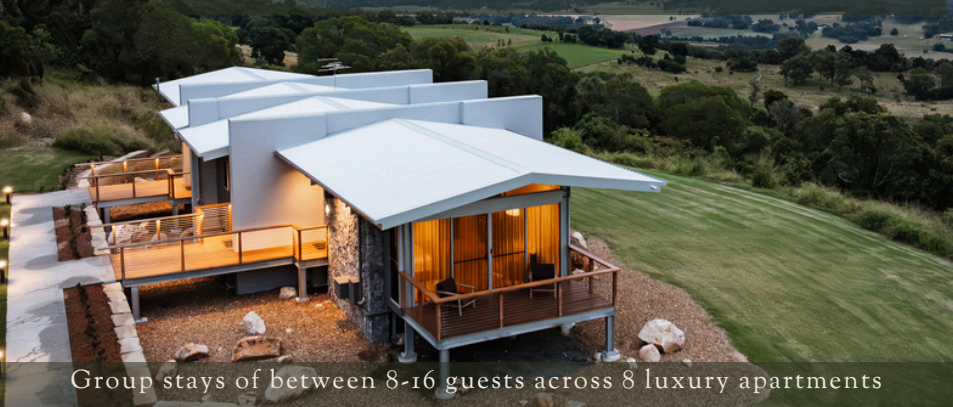
Group stays of between 8-16 guests across 8 luxury apartments

Mount French Lodge is like no other - the residence & rooms are gorgeous, the view spectacular and the food outstanding. The hosts, were lovely and attentive. It is a very special, relaxing and luxurious getaway. Highly recommend. Annabel Russell