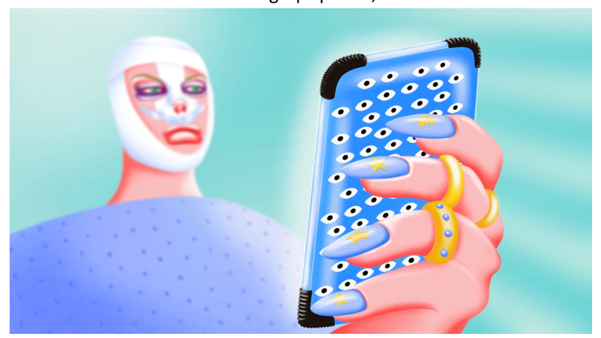
Influencers say the combined incentives of social media attention and discounted service have made cosmetic procedures hard to avoid.