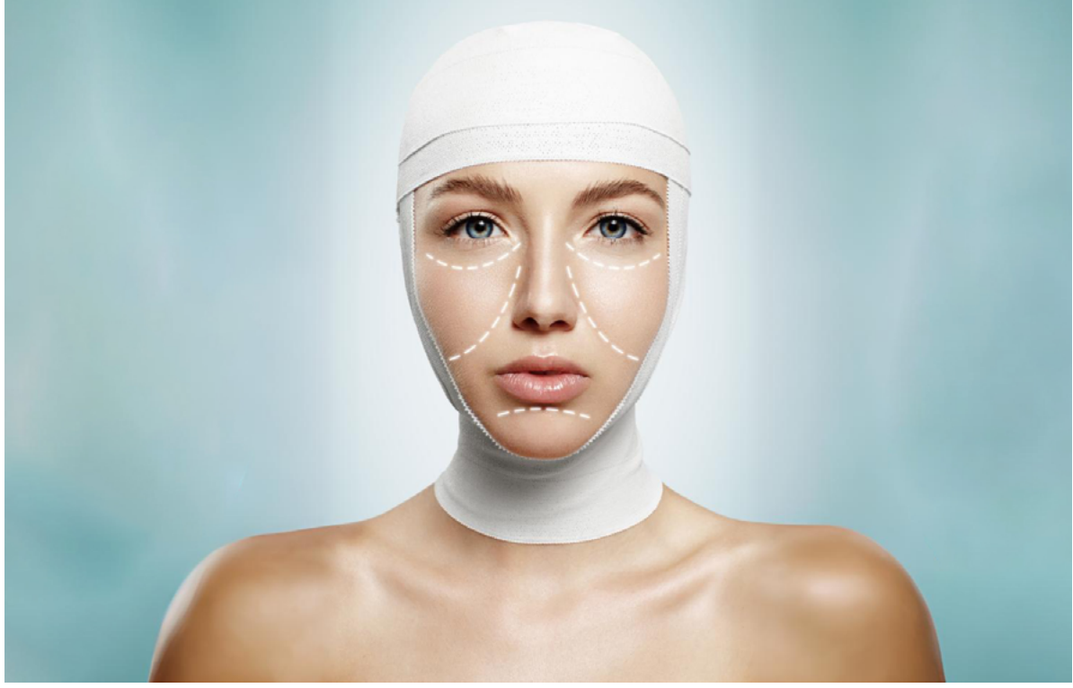
woman after plastic surgery with tied head and lines

Over the last six months, Allure has been exploring the phenomenon of the facelift in our series, Want a Lift? And in the process we have spoken to over two dozen plastic surgeons. They've taught us a lot about the reality (and myths) of mini facelifts, the ideal age to get a facelift, even how a patients' injectables might complicate a potential surgery down the road.