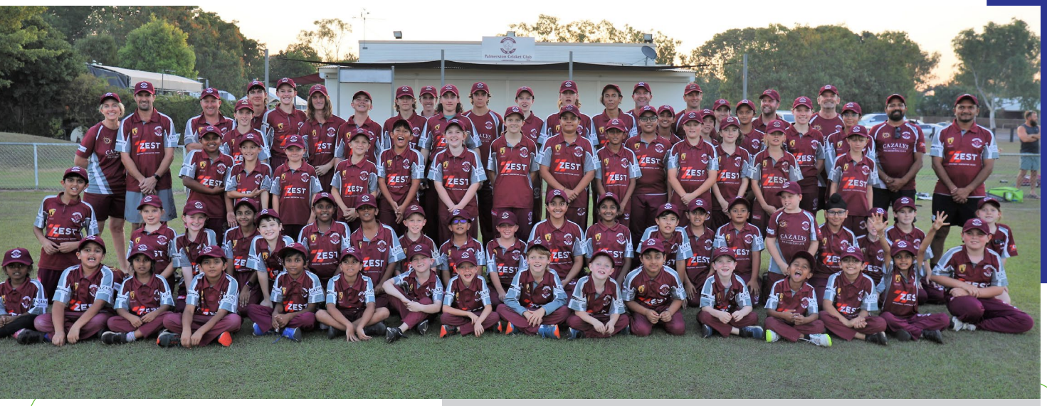
Some of Palmerston Cricket Club's junior players with their managers and coaches.

Core Lithium was pleased to launch its inaugural Community Grants Program in 2023. We were very excited to support 20 community organisations over 2 funding rounds this year, in areas including health and wellness, sport and recreation, and education. Core Lithium's Community Grants Program is aimed at benefiting the Greater Darwin community through supporting grassroots and community-led initiatives that are essential for the vibrancy of our community.