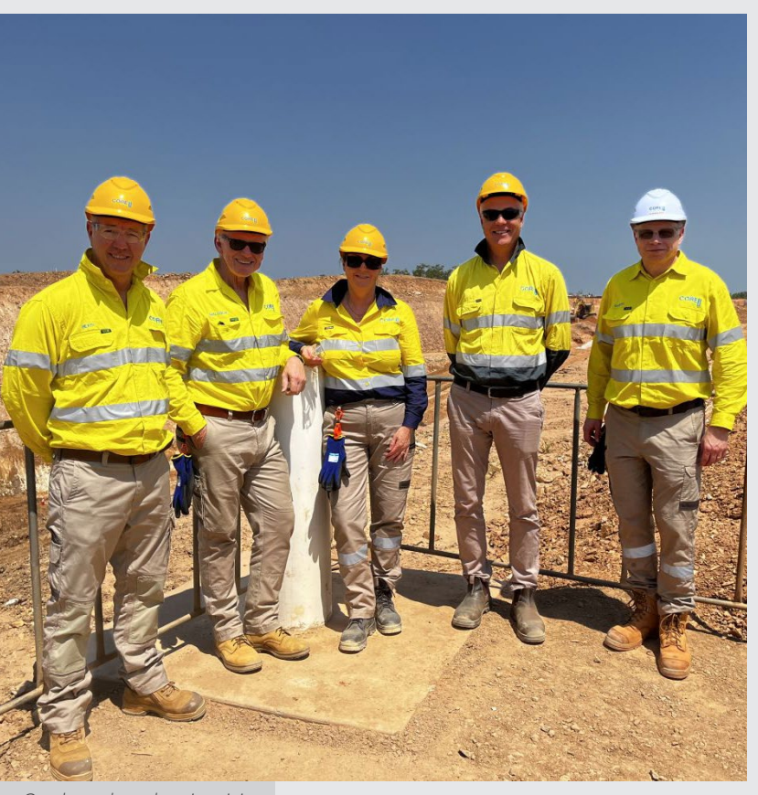
Our board on the site visit.