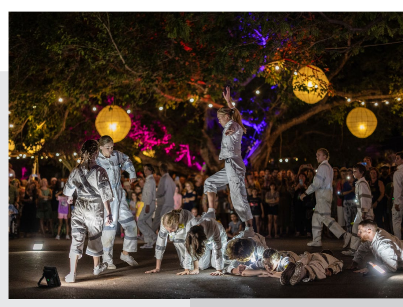
Life/Time performance in Festival Park.