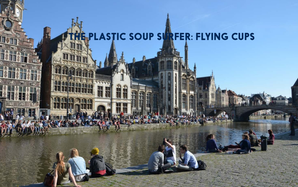
THE PLASTIC SOUP SURFER: FLYING CUPS