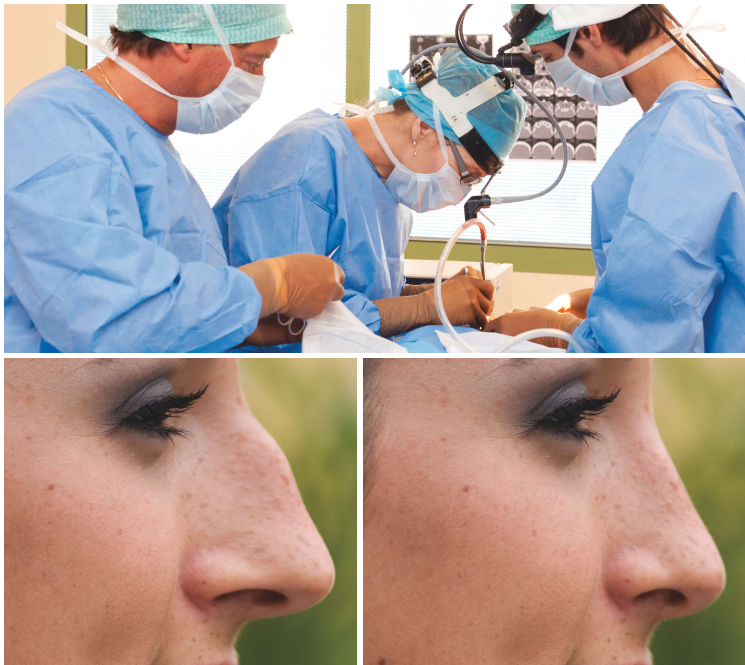
Powered microsaws are particularly beneficial for evenly reducing bumps of bone and cartilage on the nasal bridge.