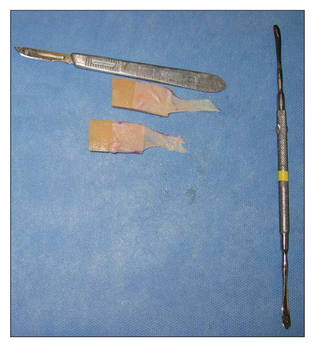
Figure 1. Photograph of harvested cadaveric frontal bone samples with attached native periosteum.

Samples were collected from 3 different cadaver frontal bones. Native samples (n=9) consisted of periosteum still attached to the bone surface, whereas BioGlue samples (n=12) consisted of dissected periosteum reattached to the bone surface using BioGlue Surgical Adhesive. One native and 3 BioGlue samples sustained periosteum tissue rupture prior to shear occurring (the periosteum itself tore before being sheared from the bone; see "Tear" in Results column in the Table ). Data from samples that ruptured were not used to compare shear strength values because shear did not occur. In the cases of periosteum rupture, the bond to be sheared—whether native or BioGlue—remained intact, indicating that the bond was stronger than the tensile strength of the periosteum tissue for these samples.