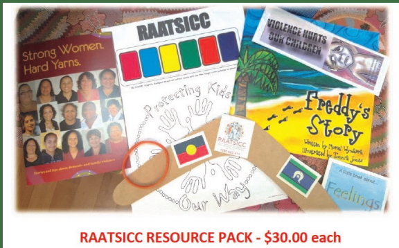
RAATSICC RESOURCE PACK - $30.00 each

Phone: 1300 663 411 or email: info@raatsicc.org.au