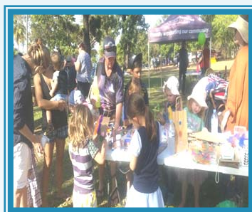
Many families gathered around the RAATSICC stall to be part of the creative process and speak with RAATSICC staff