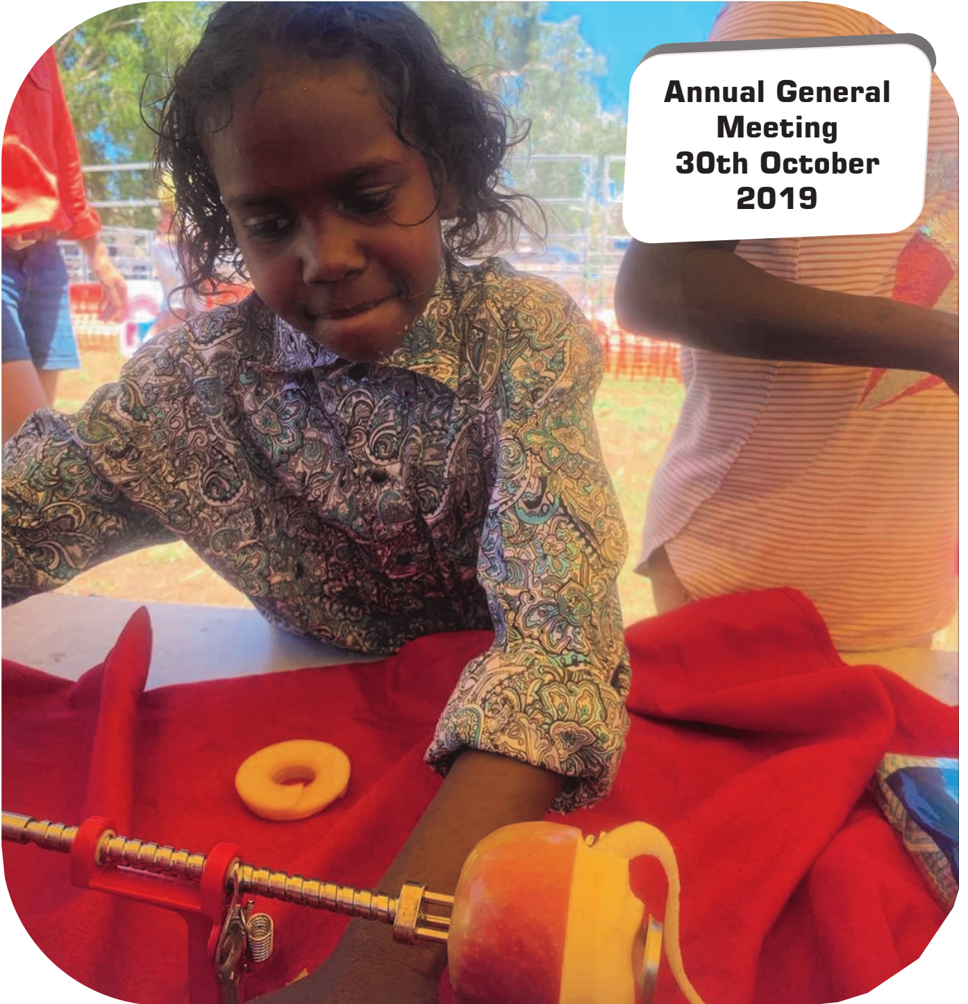
Concentrating on the apple slinky at the Pormpuraaw Annual Bull Ride

Annual General Meeting 30th October 2019