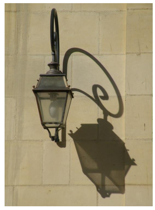
VIGNERON, CC BY-S.A 3.0

A small source of light (for example, a small spotlight) forms a dark shadow with sharply defined edges. A physically large source of light casts a shadow that is dark in the centre but lighter and fuzzier around the outside. One reason for the blurring can be the size of the source – the larger the source, the larger the number of directions from which light can come, forming many overlapping shadows, each slightly different. You can see examples of this in the shadows formed by a fluorescent light. Diffraction (light's capacity to bend) is another reason for shadows to lighten and blur around the edges.