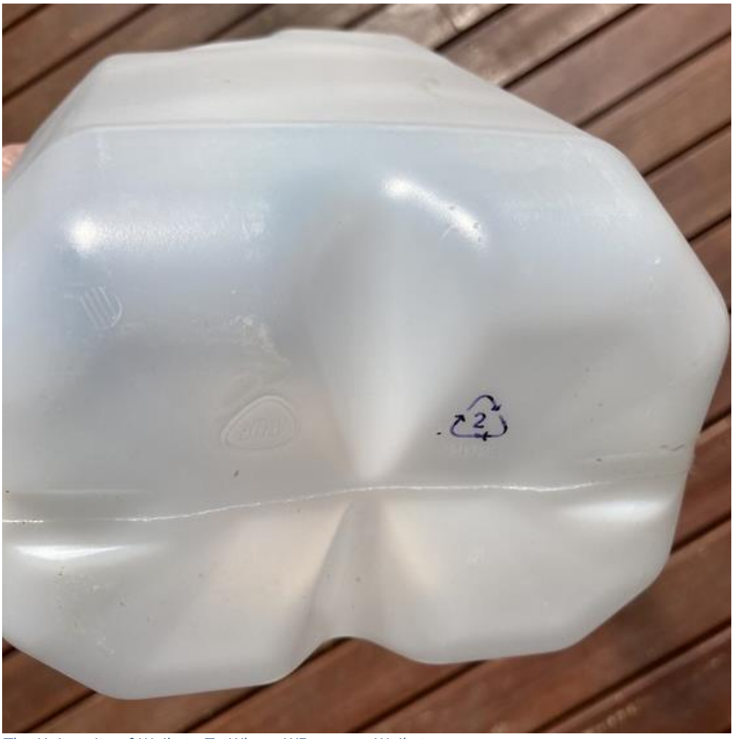
The University of Waikato Te Whare Wānanga o Waikato

Waste is classified based on the physical properties of rubbish (rāpihi). Rubbish is sorted into categories (rōpū, wehenga) so that it can be disposed of in the most effective way.