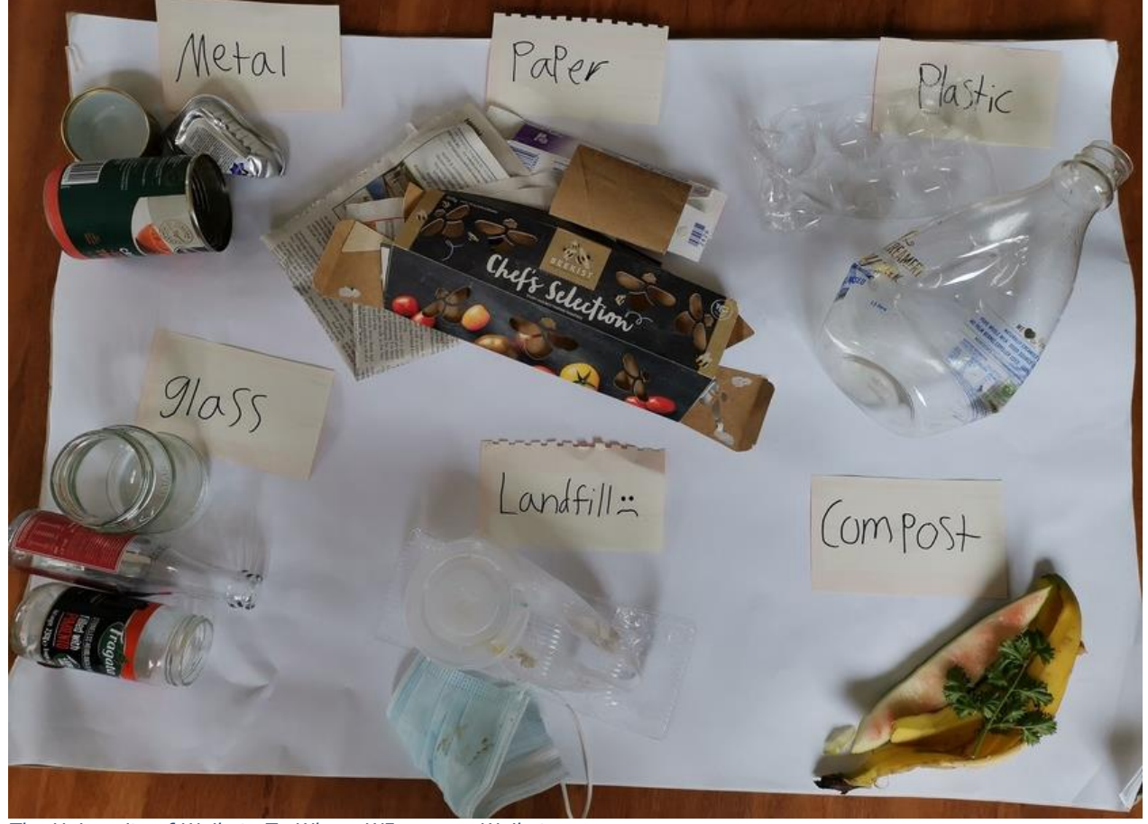
The University of Waikato Te Whare Wānanga o Waikato

We can sort (whakawehewehe) rubbish in a variety of ways using senses, material properties and origins (pūtake). Senses can be used to classify rubbish (rāpihi). Rubbish can be sorted by its properties as in the <a href="Physical properties of rubbish table">Physical properties of rubbish table</a> and by its origins in the <a href="Waste classification">Waste classification</a> table (pūtakenga).