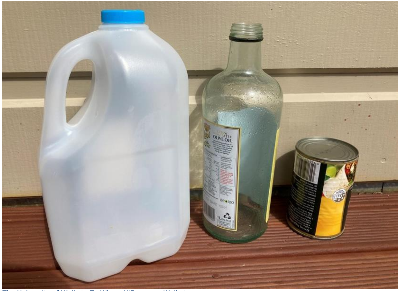
The University of Waikato Te Whare Wānanga o Waikato

Identifying what an item is made from helps to work out the best disposal method. Glass comes in many different colours and shapes but has similar properties and is classified similarly in the classification phase.