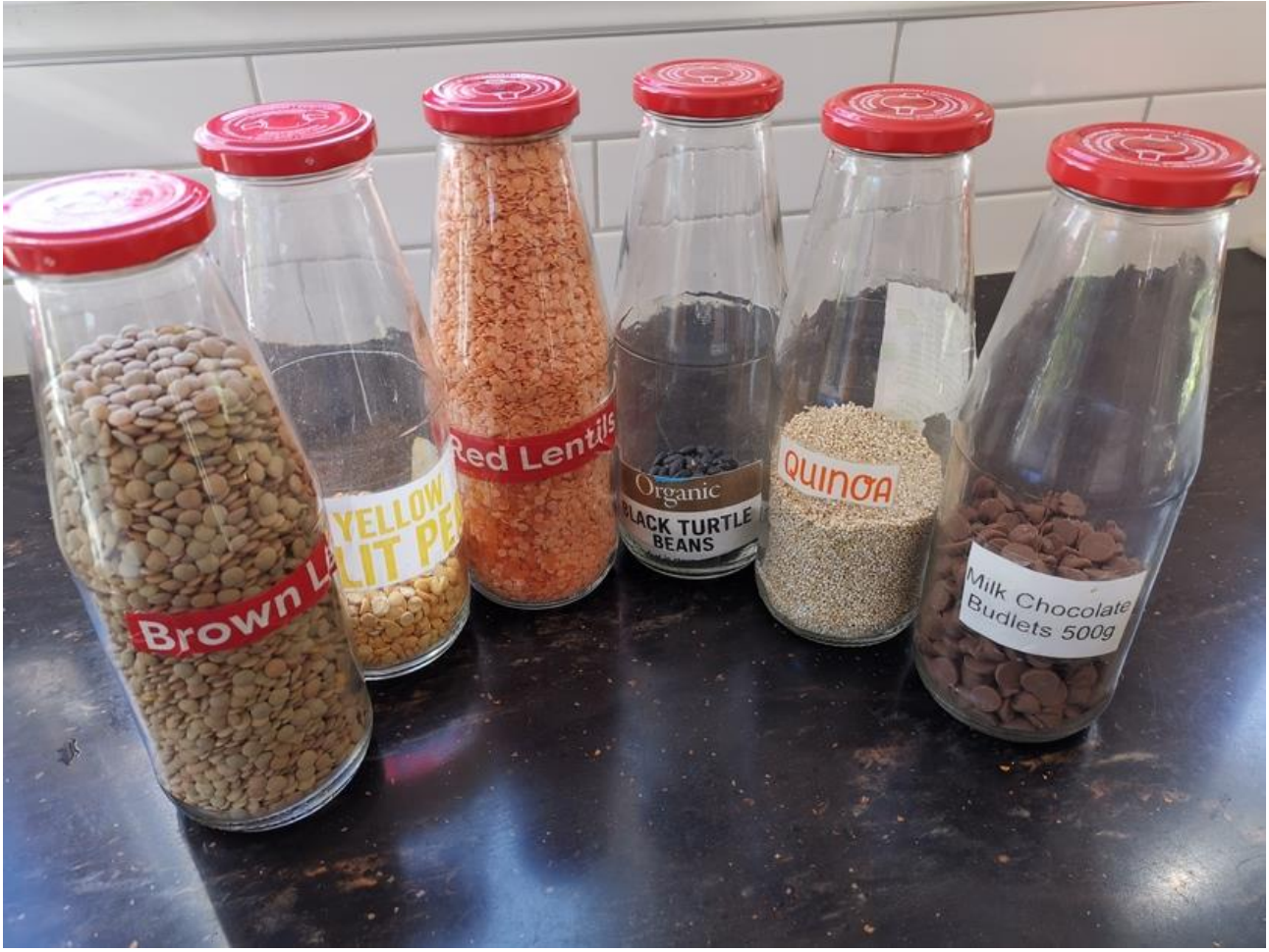
The University of Waikato Te Whare Wānanga o Waikato

We can reduce the amount of rubbish that we produce.