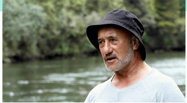
Tūhono ā kura ki te riu o Whangārei