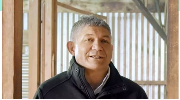
Hawke's Bay Regional Council.