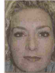
Before and after photos of a patient show how Botox injections help relax the vertical lines or furrows between the brows.