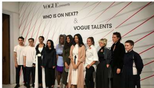
Vogue Talents Milan, Italy SS17 Collection