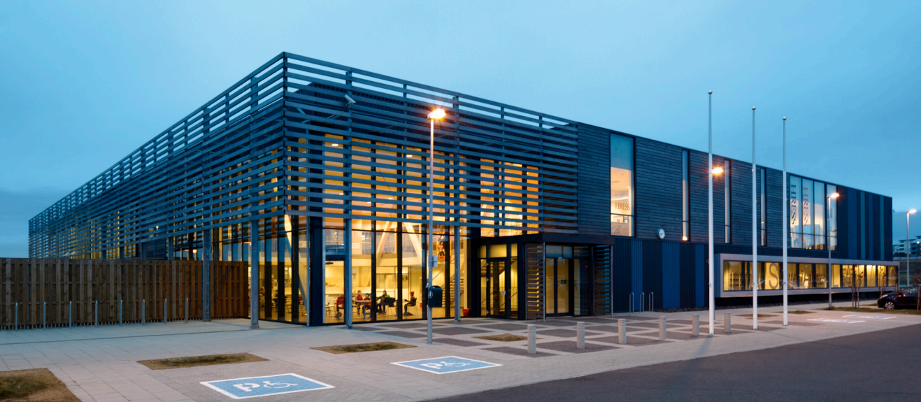
Asvallalaug - Health and Sport Centre