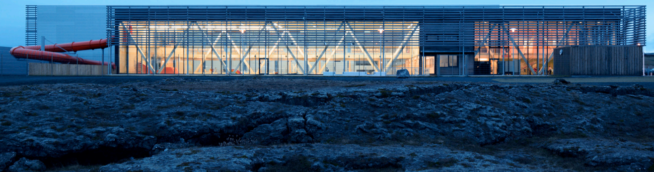
Asvallalaug - Health and Sport Centre