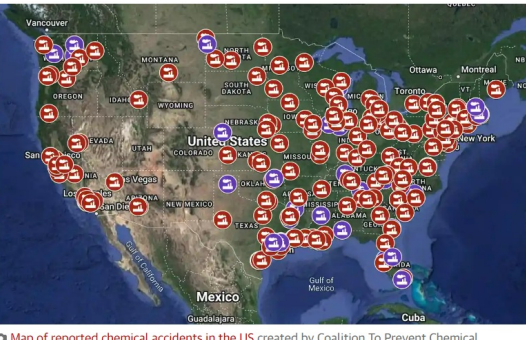
Disasters. Red iconsi indicate accidents in the US created by Coatition To Prevent Chemical Disasters. Red iconsi indicate accidents from 1 January to 31 December 2022. Purple icons indicate accidents since 1 January 2023.

The breaking news about the Norfolk Southern train derailment and chemical disaster in Ohio began a deluge of headlines about chemical spills. According to a recent article in the