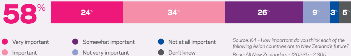
Percentage of New Zealanders who think India is very important/important to New Zealand's future.

40-49 years, male, NZ European and other European, Canterbury