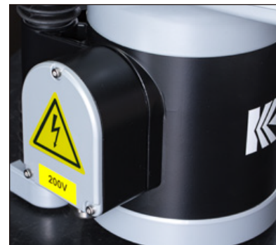
Splash proof terminal box