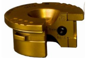
One touch holder