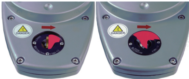
1.5 times open space for normal