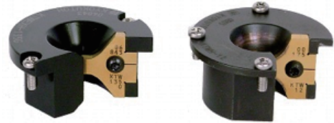
eliminated screw head from holder surface