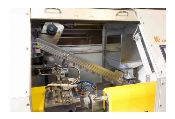
• Tip Conveyor Function Additional 800 tips can be supplied.