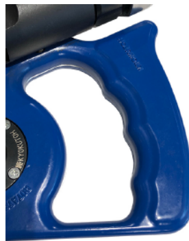
Easy handling design