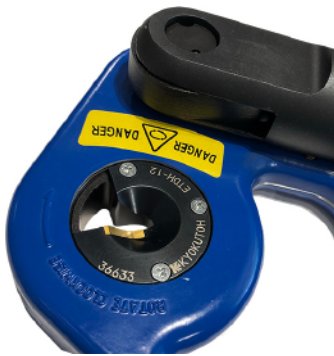
Correspond variety tip shape