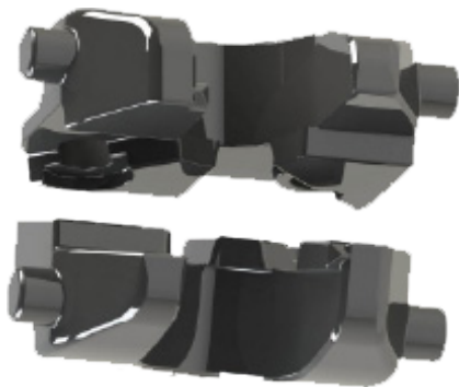
Strong Nail by upper and lower alternate structure