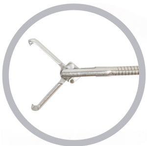
Rat Tooth Forceps