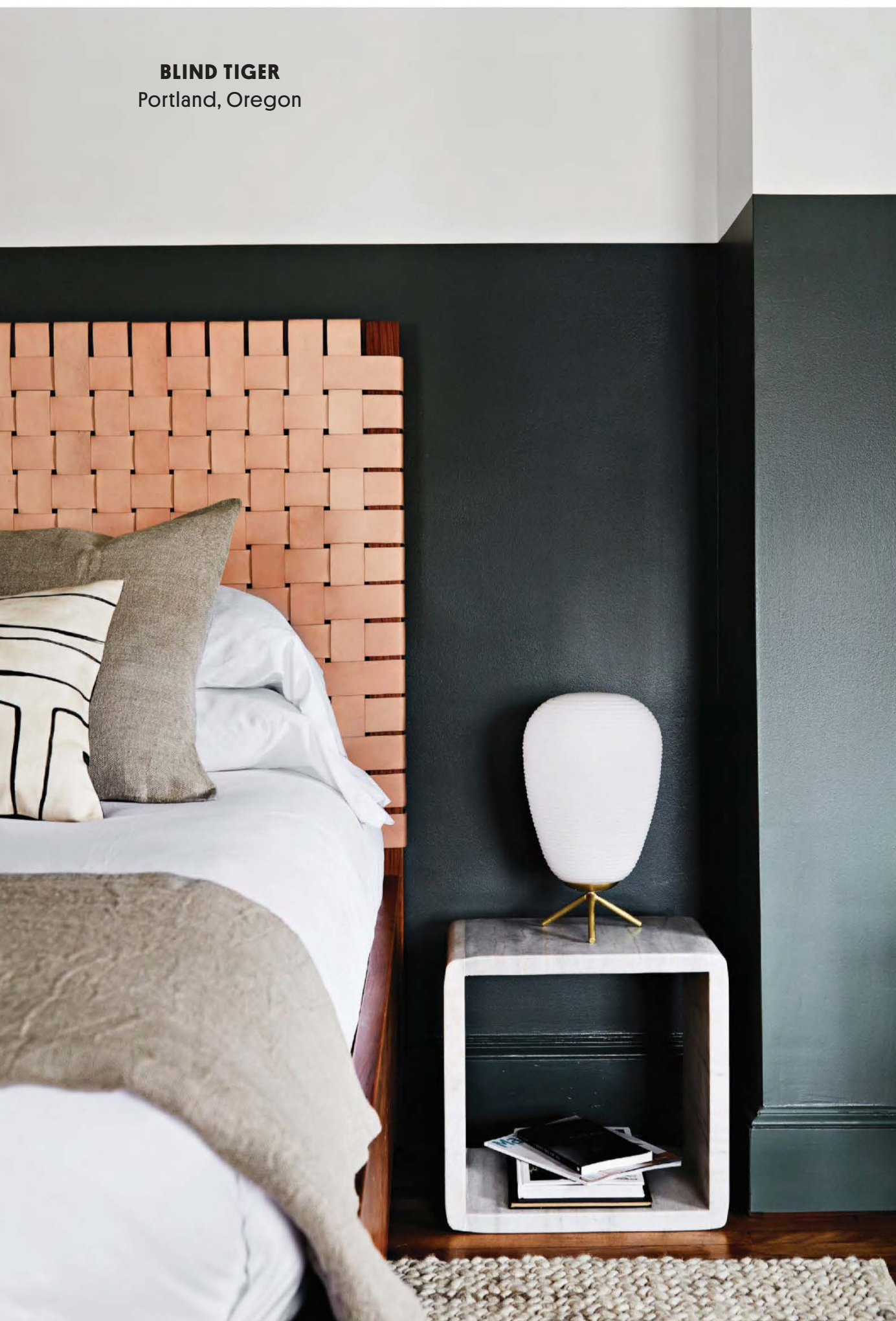
BLIND TIGER Portland, Oregon