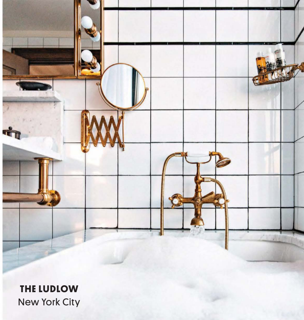
THE LUDLOW New York City

The maximalist approach makes a simple white bathroom look over-the-top elegant. Invest in ornate knobs, showerheads, mirrors, and more. Note: Copper, brass, and bronze are always nice.