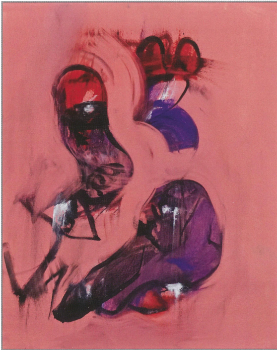
8 Balaban , 2018

12 Clown , 2019 Oil on canvas, 20 x 16 inches