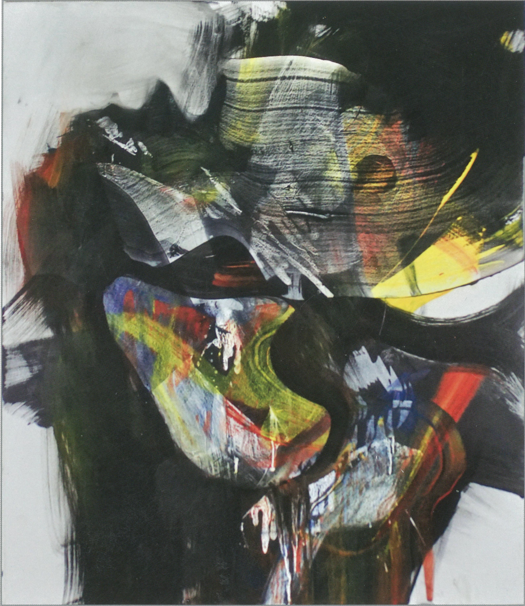
| Aloha, 2018