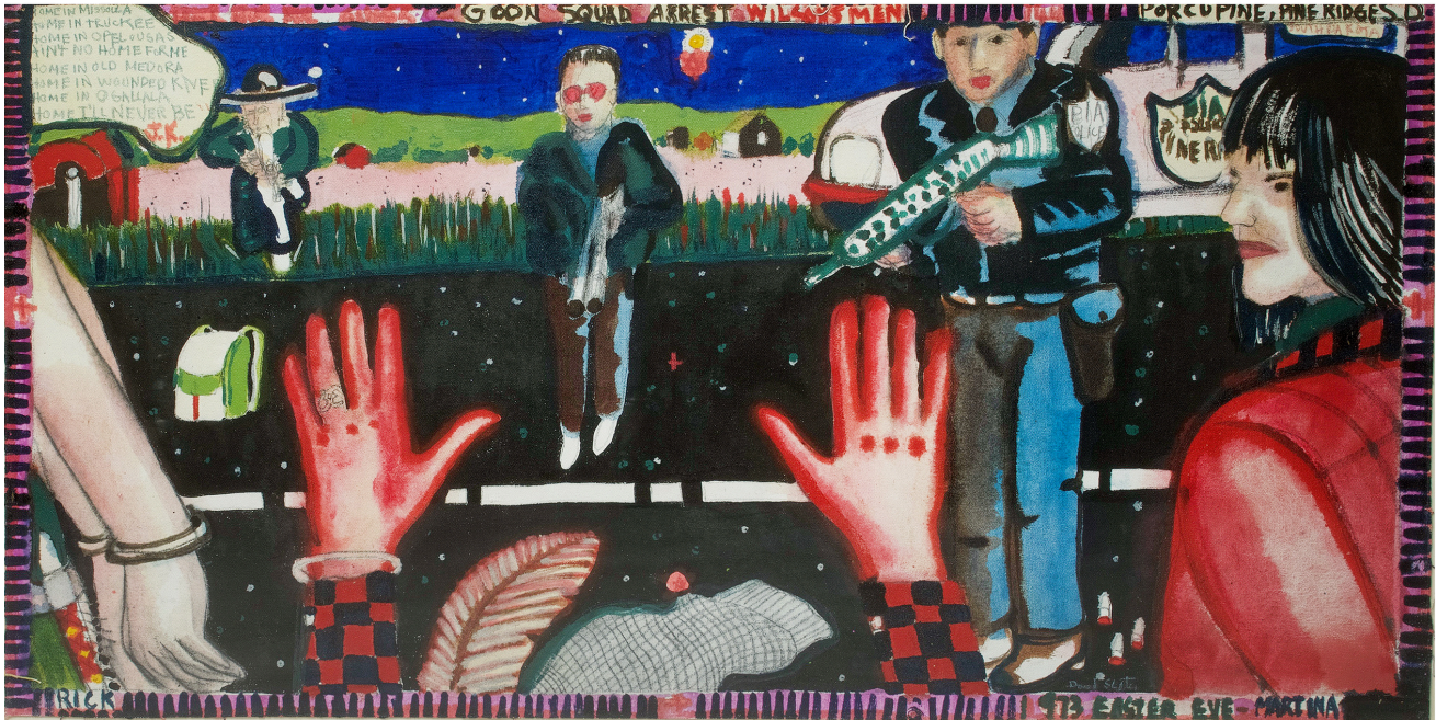
David Slater, Easter Eve , ca. 1985, Oil on canvas