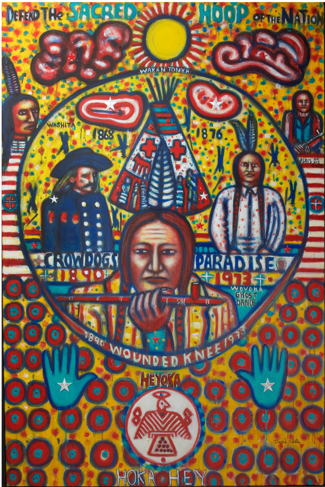
David Slater, The Sacred Hoop , ca. 2019, Acrylic, mixed media on canvas