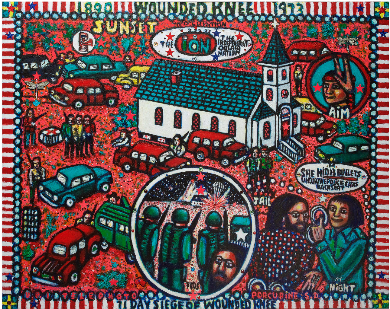
David Slater, The Siege of Wounded Knee , ca. 2020, Acrylic, mixed media on canvas