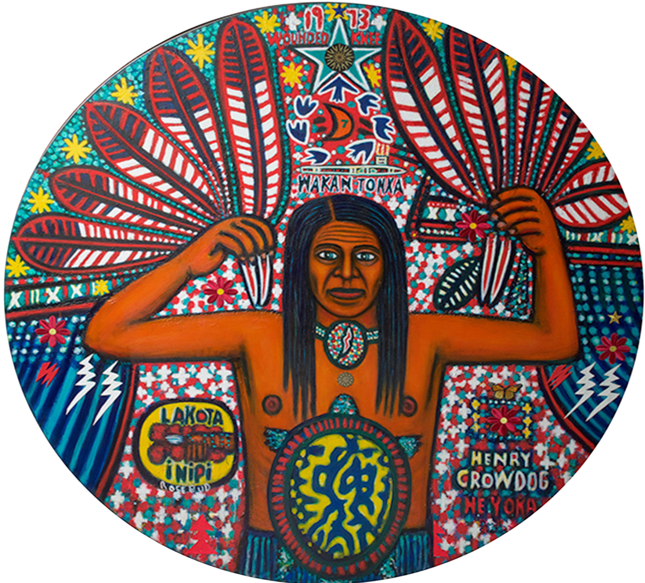
David Slater, Crow Dog's Paradise , ca. 2019, Acrylic, mixed media on canvas