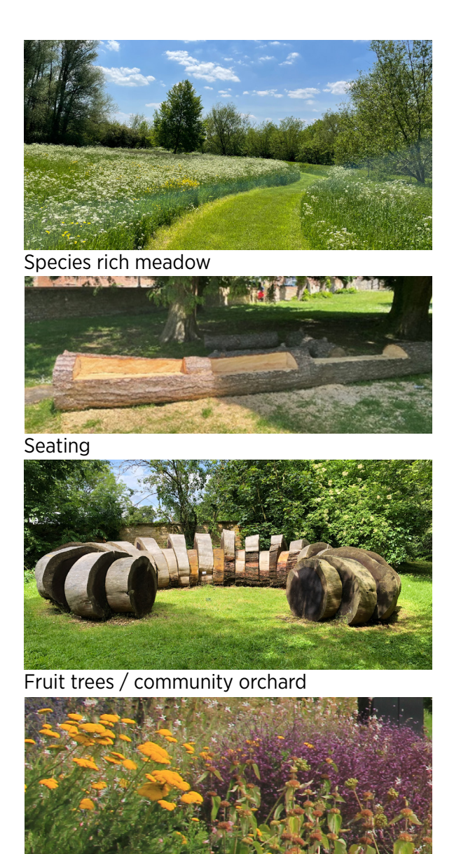
Perennial garden planting