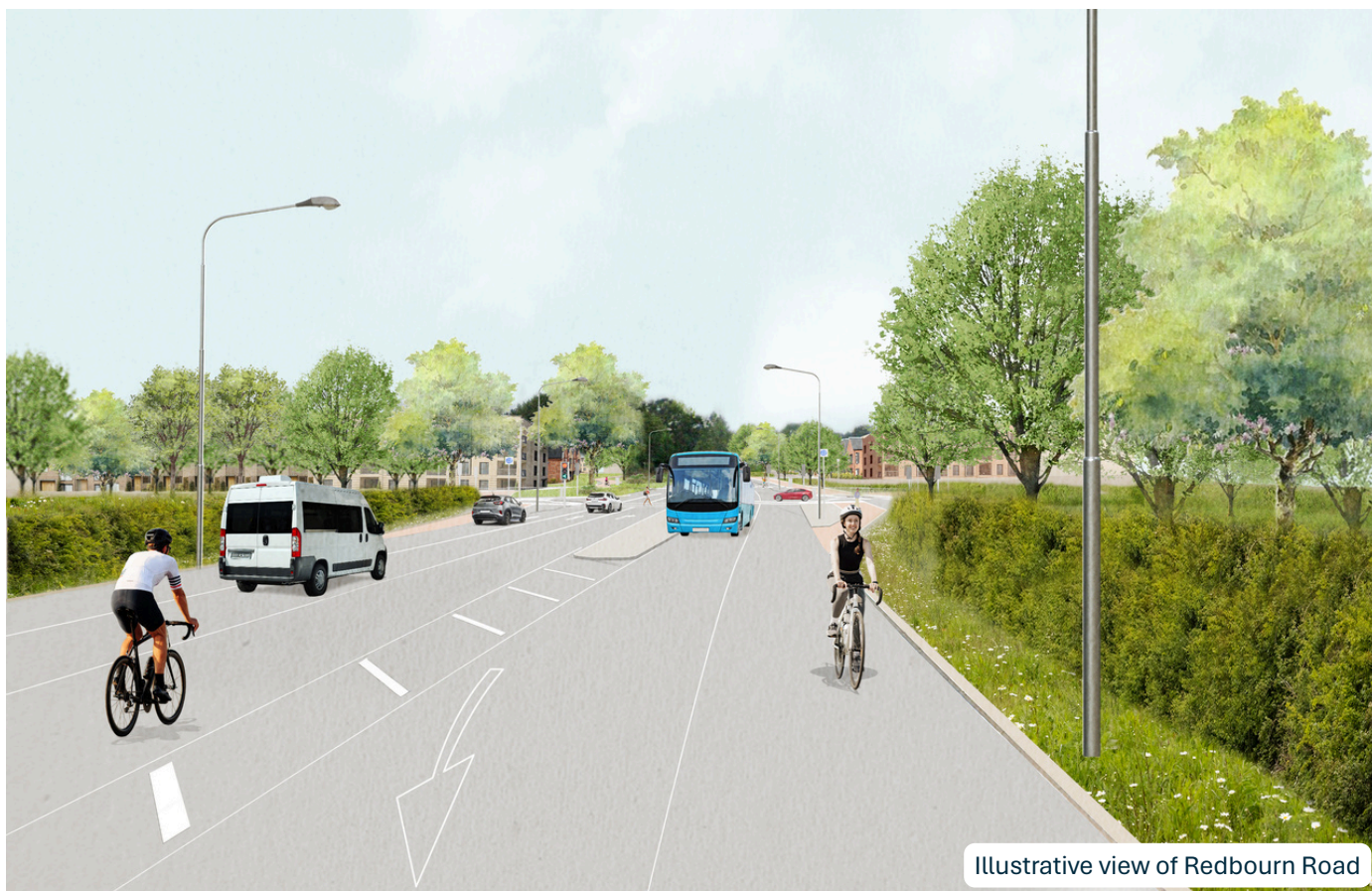
Illustrative view of Redbourn Road

Travel behaviour and the performance of the transport system can evolve over time, so flexibility is essential. Through structured monitoring, dynamic management, and stakeholder collaboration, this approach helps promote sustainable, safe, and efficient travel for the local community.