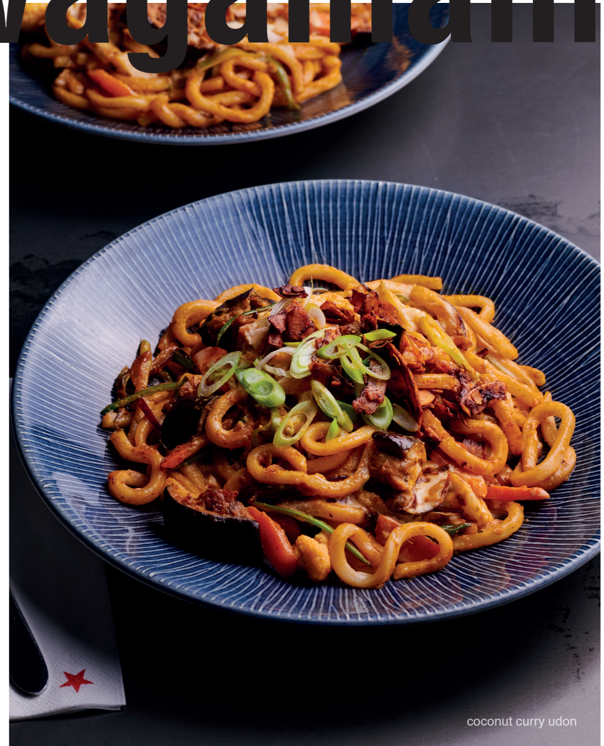
coconut curry udon