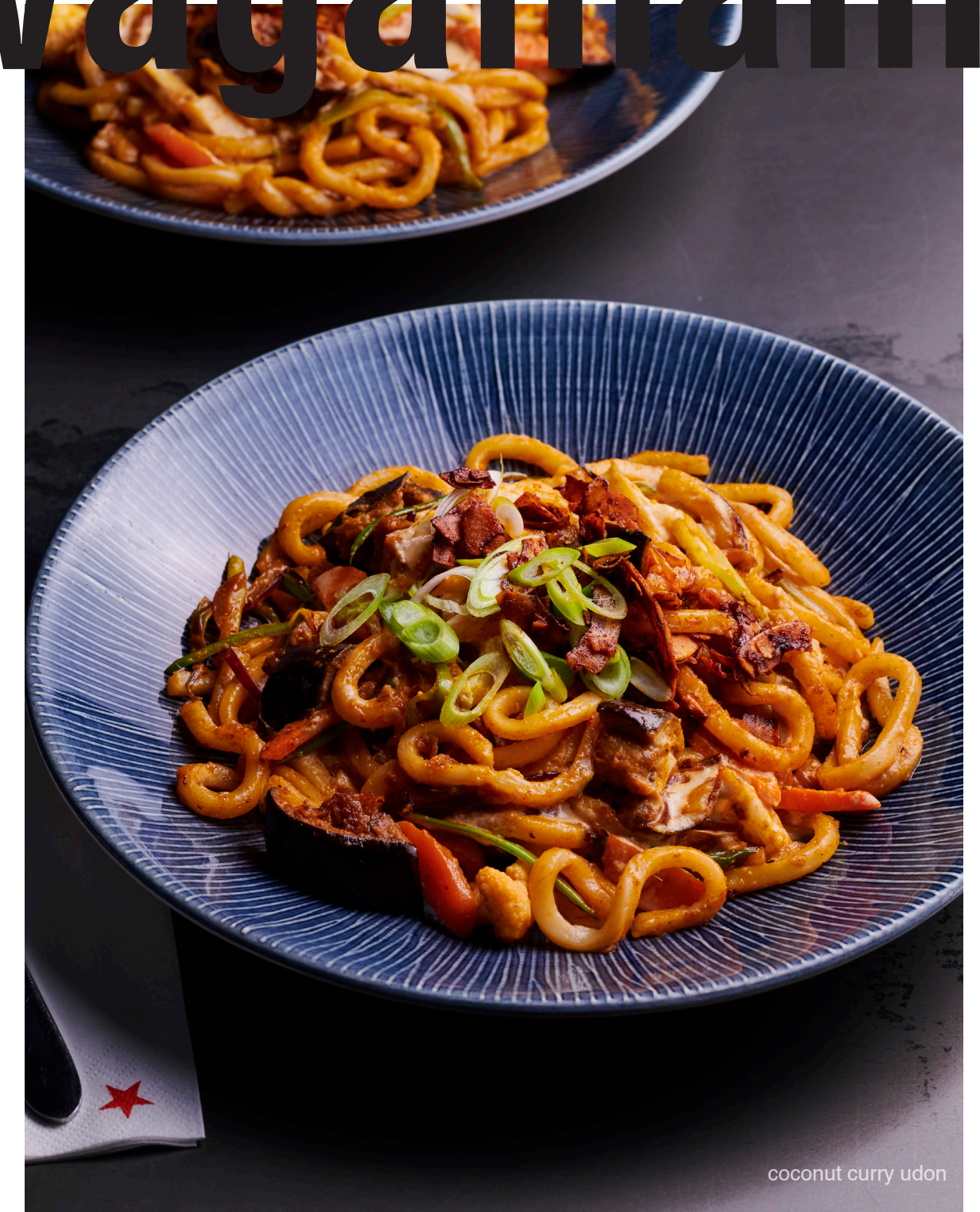
coconut curry udon