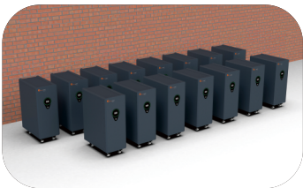
Support 15 Pcs in Parallel