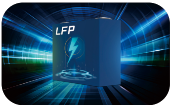
Longer Lasting LiFePO4 Battery

*Refer to Felicitysolar's Warranty Policy for applicable conditions.