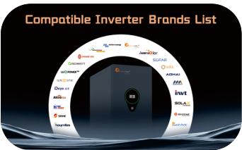
Wide Inverter Compatibility