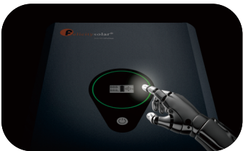
Real-time Status via LCD Display