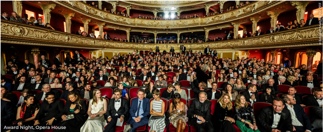
Award Night, Opera House