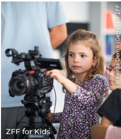
ZFF for Kids