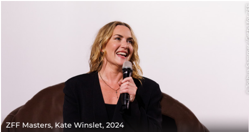
ZFF Masters, Kate Winslet, 2024