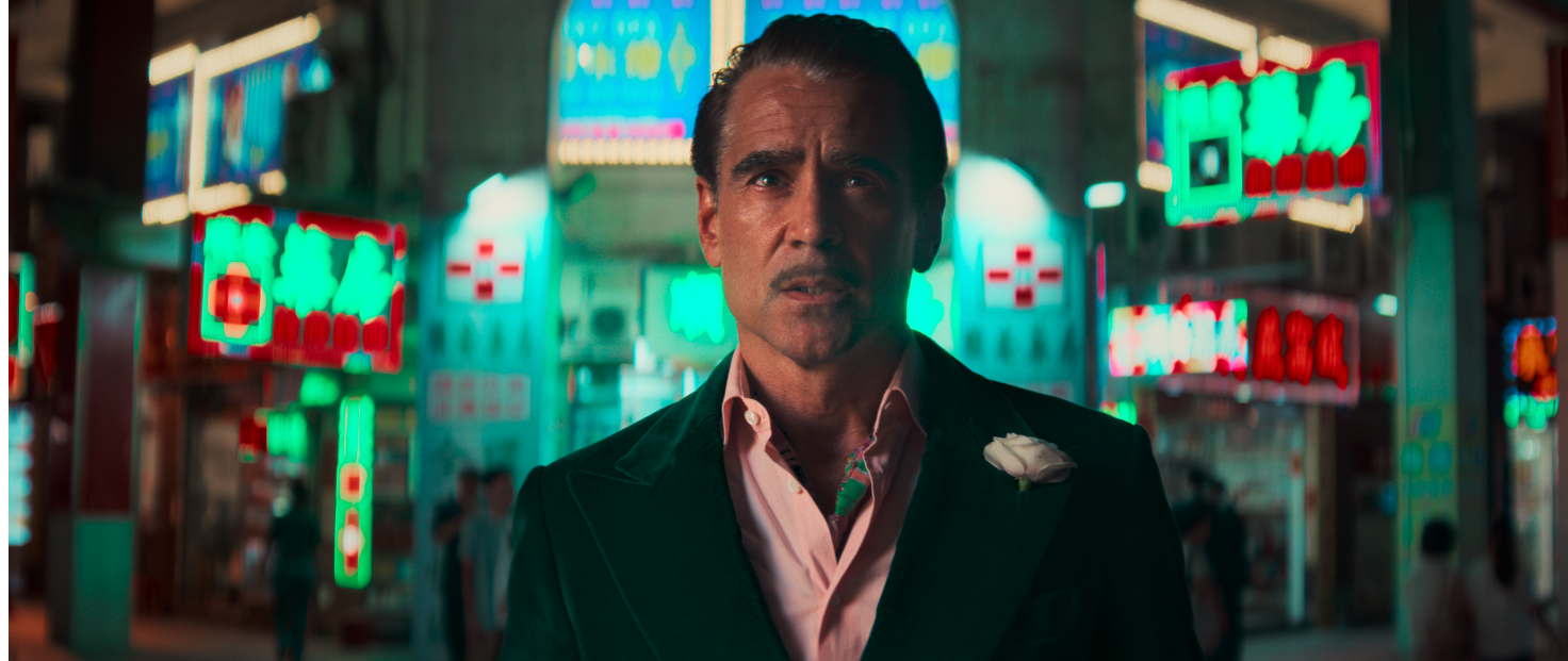
BALLAD OF A SMALL PLAYER

Colin Farrell is also delighted about receiving the Golden Icon Award and coming to Zurich: «I'd like to thank Zurich Film Festival for inviting BALLAD OF A SMALL PLAYER to the festival, and for honoring me with the Golden Icon Award. It'll be my first time visiting the beautiful city of Zurich and I'm beyond excited to walk its streets, drink its coffee and move amongst its people. It's both generous and humbling to have my years of making film recognized by such a storied festival, one that champions film from all corners of the globe. It will be an absolute pleasure to visit later this year and we are thrilled to be bringing BALLAD OF A SMALL PLAYER to audiences there.»