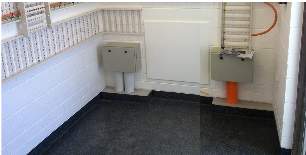
Figure 7.10 — Typical Cable Entry Plinth & Sealing Enclosures (Note covered vinyl flooring, segregation and powder-coated cable trays)