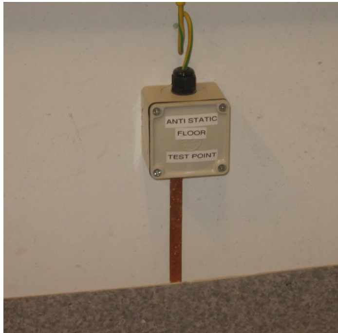
Figure 7.7 — Typical Antistatic Flooring Junction Box

Note: The final connection of the copper conductive tape to earth and the installation of the junction box and resistor needs to be made by the electrical trade.