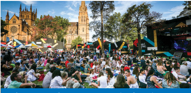
Sydney Festival 7–26 January sydneyfestival.org.au

Sydney in summer is the place to be, and New Year's Eve is just one night in a packed season of events.