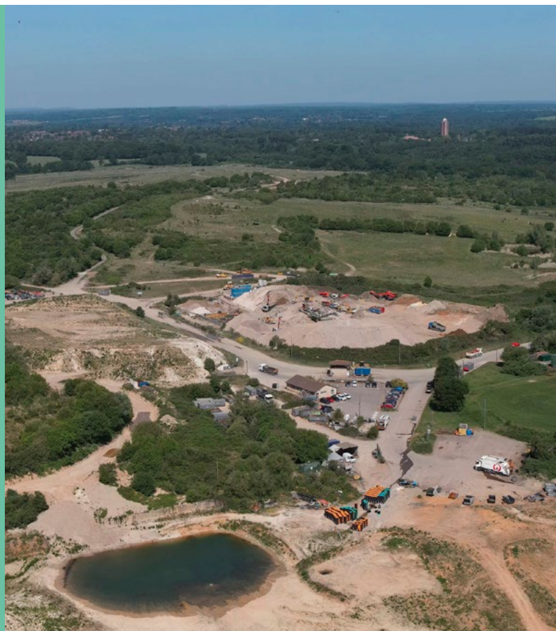
Aerial image of part of current site proposed for development

SDCM40 CAMPUS must appear uppercase and with no space between SDC and M40