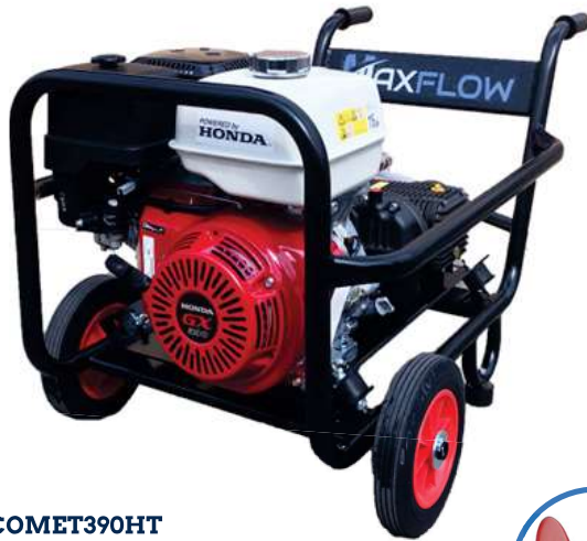
Model - COMET390HT