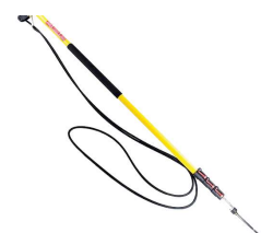
Telescopic Lance Page No: 50