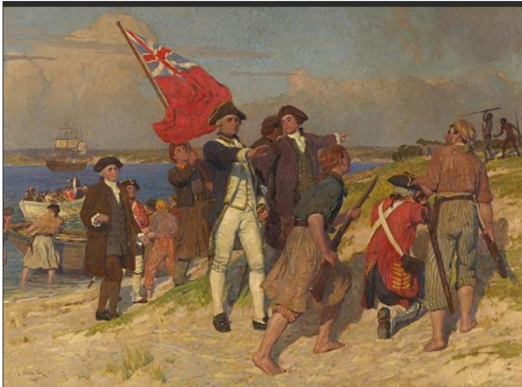
Landing of Captain Cook at Botany Bay, www.ngv.vic.gov.au/explore/collection/work/5576/