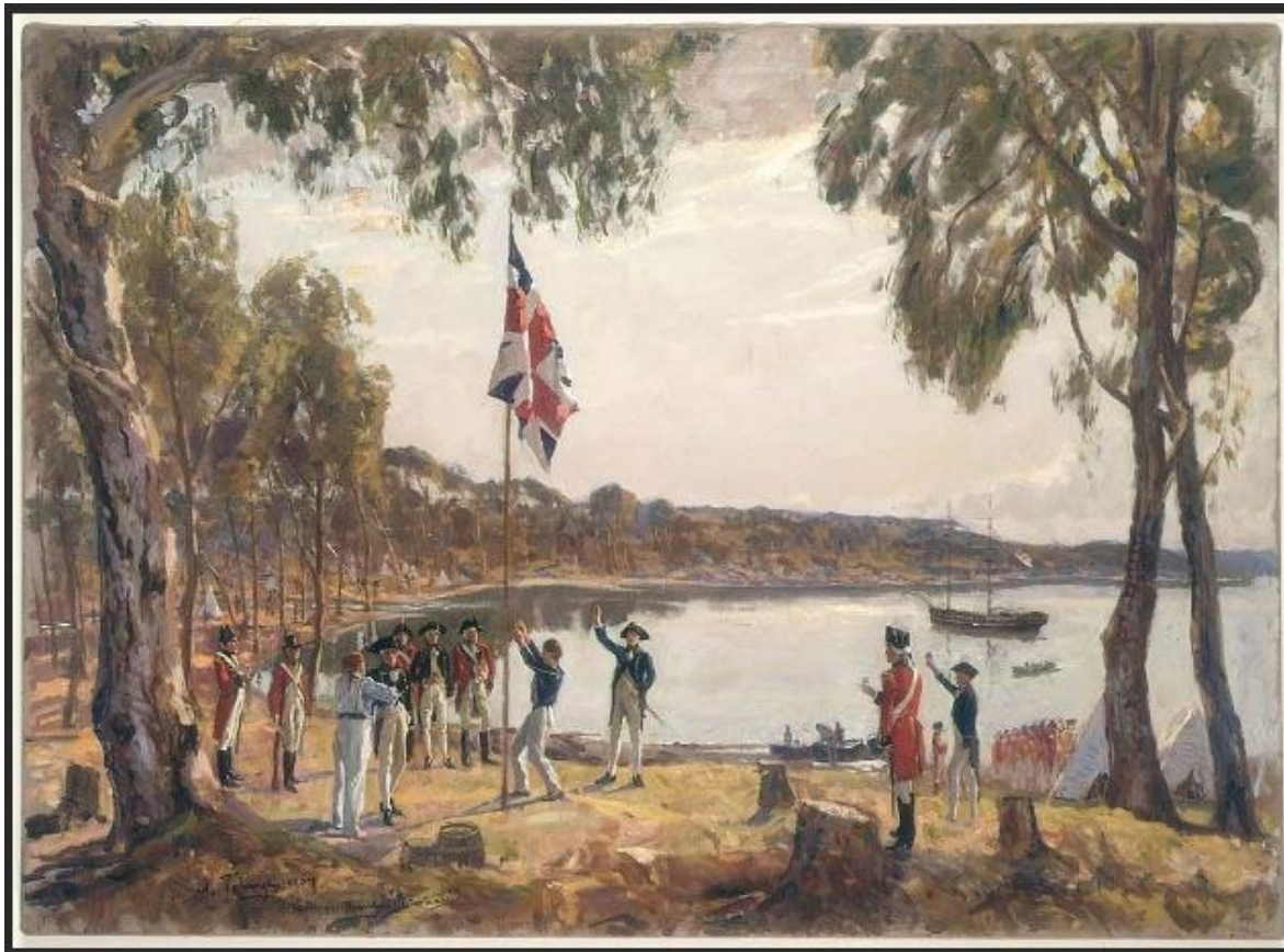
The Founding of Australia by Captain Arthur Phillip RN Sydney Cove, Jan 26 th , 1788, Algernon Talmage RA https://www.sl.nsw.gov.au/collection-items/founding-australia-capt-arthur-phillip-rnsydney-cove-jan-26th-1788