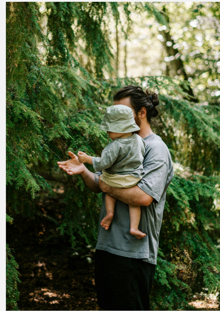
● Charles & Motee Rogers Bushland Reserve