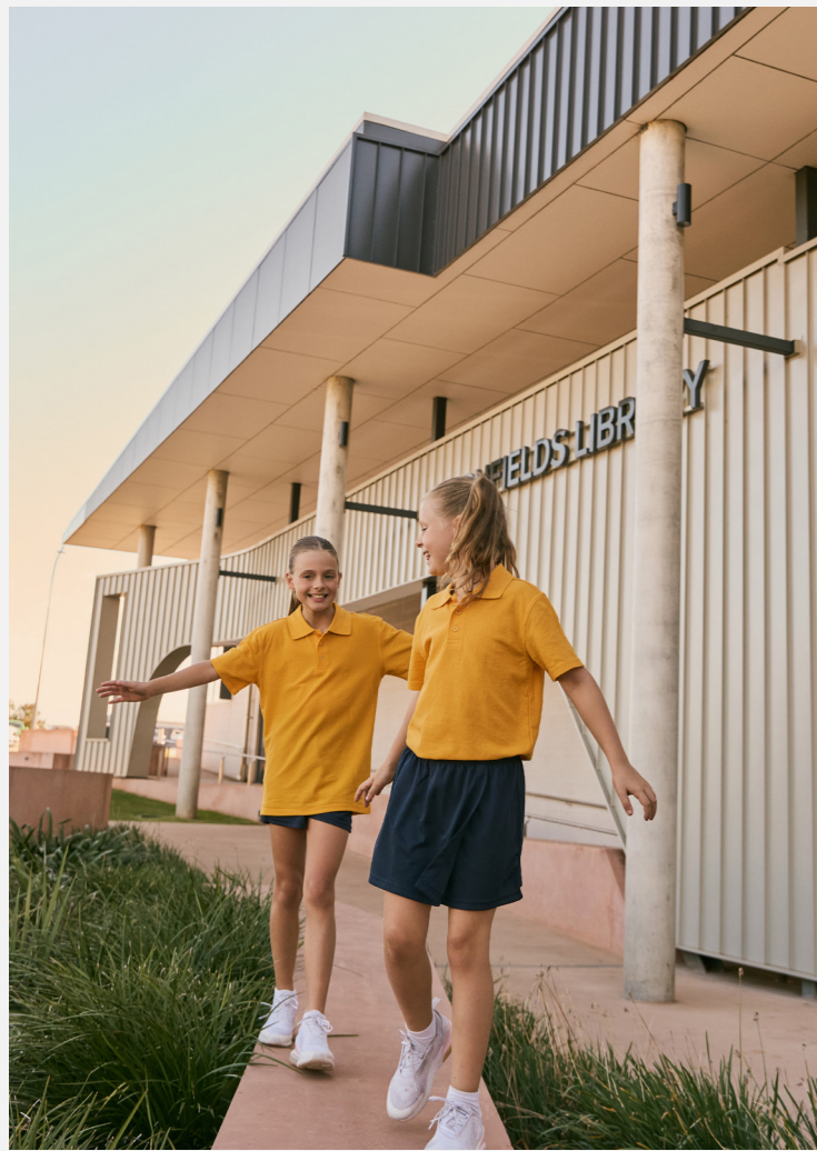
● Highfields Library