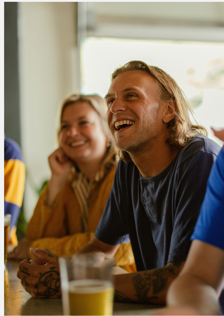
● Highfields Tavern