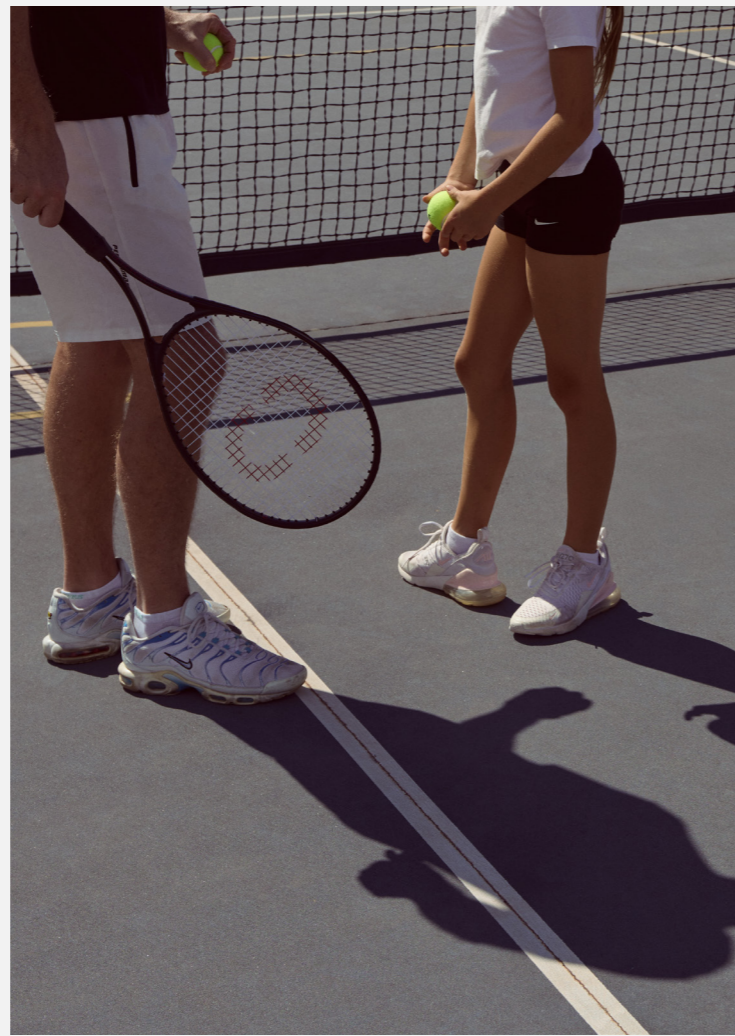
● Highfields Fitness Centre