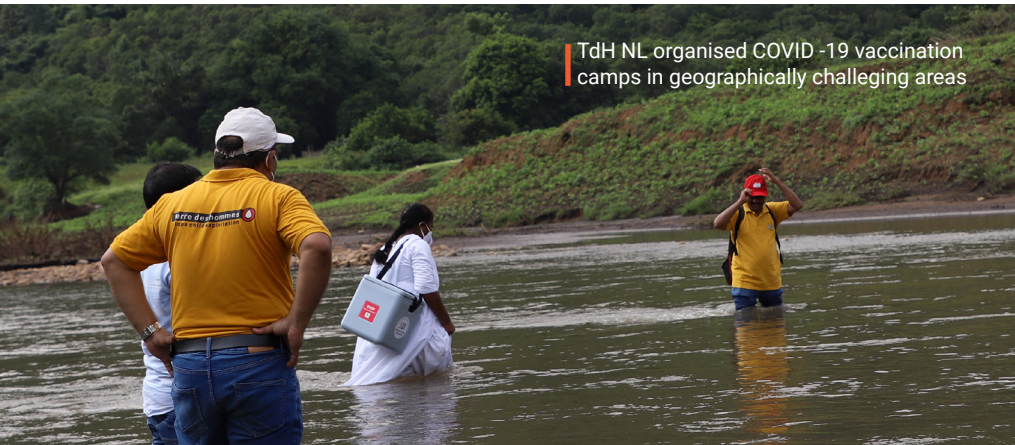
TdH NL organised COVID -19 vaccination camps in geographically challenging areas

children taken out of harmful exploitation