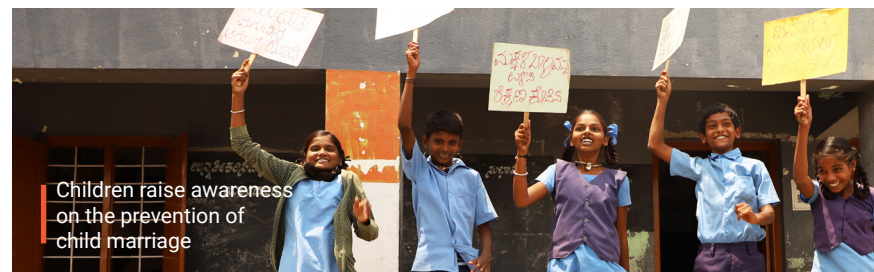
Children raise awareness on the prevention of child marriage