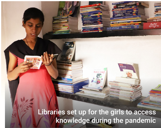
Libraries set up for the girls to access knowledge during the pandemic

83 libraries were set up for girls with books on general knowledge, story books, puzzles and exam guides.