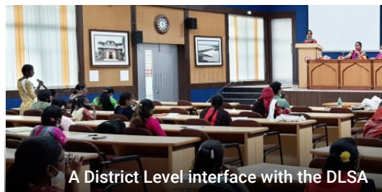
A District Level interface with the DLSA