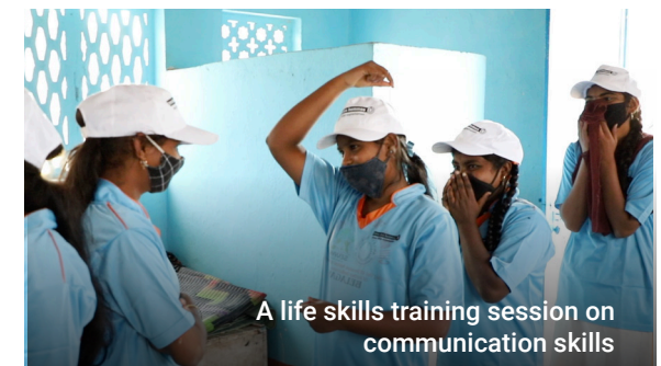
A life skills training session on communication skills