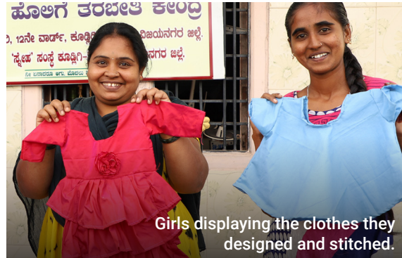
Girls displaying the clothes they designed and stitched.

in demand. Devadasi women were also provided training in financial management and a sum of Rs.30,000 each to invest in businesses such as vegetable sales, petty shop etc.