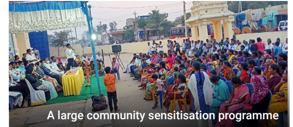
A large community sensitisation programme

The project also sensitises relevant stakeholders such as temple priests and the larger community, on the rights of Devadasis and their protection systems, so as to create a community which