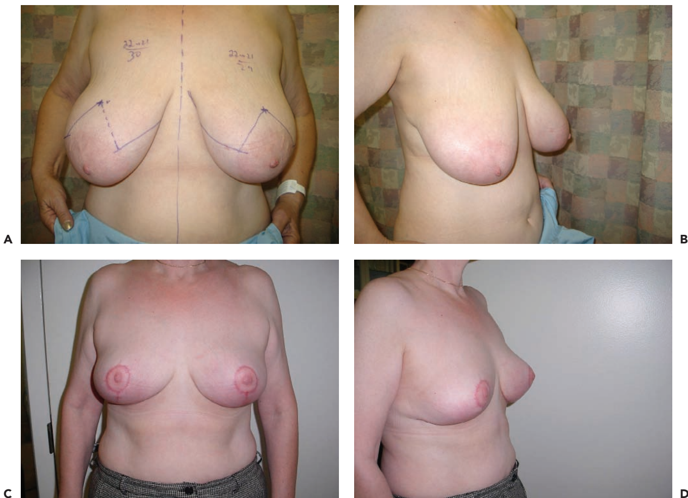
Figure 94.1. A: Preoperative sternal notch-to-nipple distance is 30 cm on the right and 29 cm on the left. The inframammary fold is at 22 cm bilaterally and the neo-nipple-areolar complex will be sited at 21 cm bilaterally. B: Oblique view. C: Postoperative result at 3 months, frontal view. D: Postoperative result at 3 months, oblique view.

Finally, a horizontal line is drawn from the inferior end point of the vertical lines to the IMF. They need not extend all the way to the medial extent or the lateral extent of the breast—a pearl gleaned from experience with the vertical-only approach. The horizontal lines meet the IMF at 1 to 4 cm from the lateral sternal border and roughly at the lateral limit of the breast crease (Fig. 94.1).