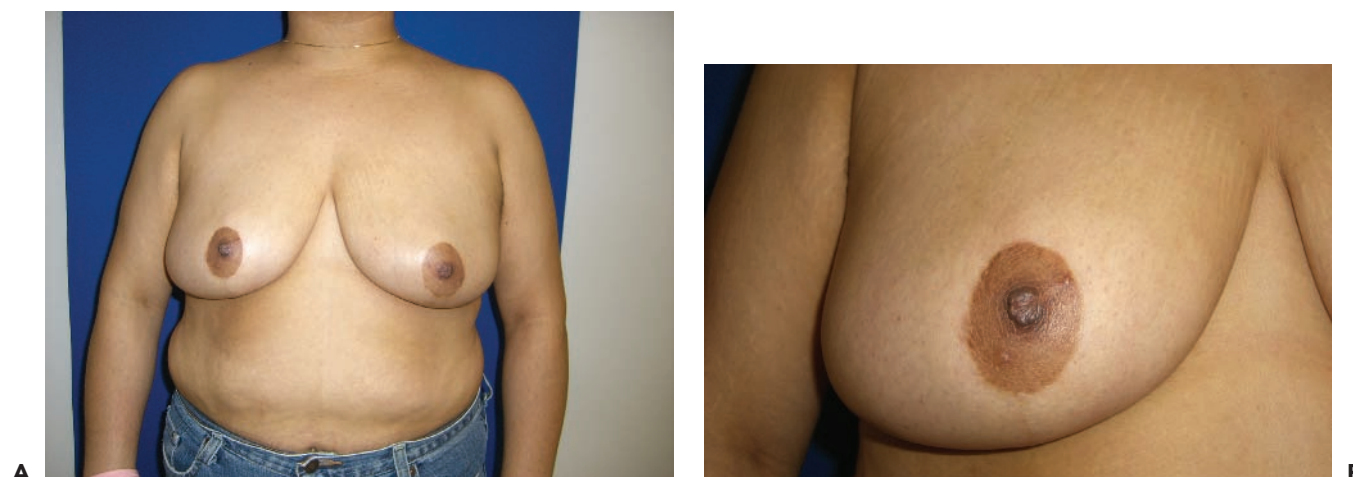
Figure 94.3. A: Frontal view, preoperative. B: Lateral view, preoperative. C: Frontal view, 6 months postoperative, glandular shaping sutures used to avoid bottoming out. D: Lateral view, postoperative.

Au: Caption not match with Fig. pls. check.