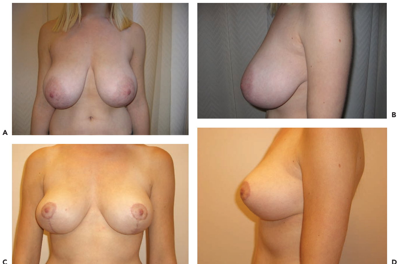
Figure 94.2. A: Preoperative view with markings. Note the deep shoulder grooves. In larger breasts, the nipple must be moved more medially. B: Postoperative view with hypertrophic scars.

Au: Caption not match with Fig. pls. check.